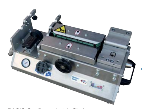
BASIC Configured with Chains.