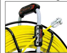
automatic run-out brake