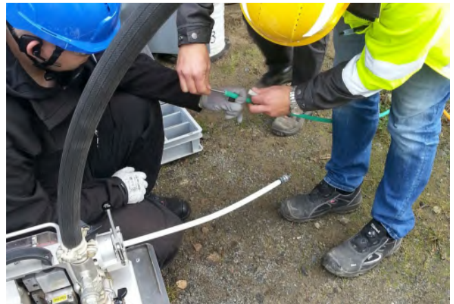
Inserting a sonde into a micro duct before connecting duct to a jetting machine.