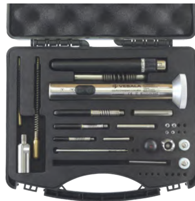
CL43 receiver and a variety of extra accessories in the carrying case. Suggested setup for 33kHz sondes is version CL43-PA (product #V00111).

By adding the CTT33 transmitter to the equipment, CL43 locator can be used as a full featured cable locator.