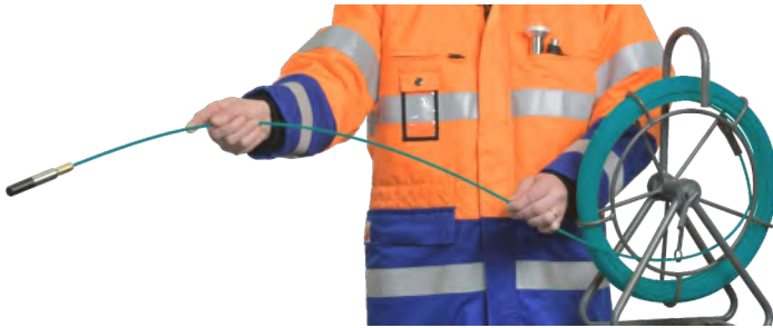
PL18-33 sonde mounted to a push rod with the PL-MSA adapter

PL18 sondes are packed in a handy plastic storage box with one lithium battery. PL42-05 is packed in a small carrying/storage case including 8 pcs LR6 batteries.