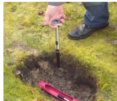
Exact location of the sonde and duct saves unnecessary digging.

© H. Vesala Ltd. 202012. Contents subject to change without notice.