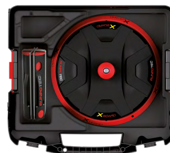
Symbolpicture -without content