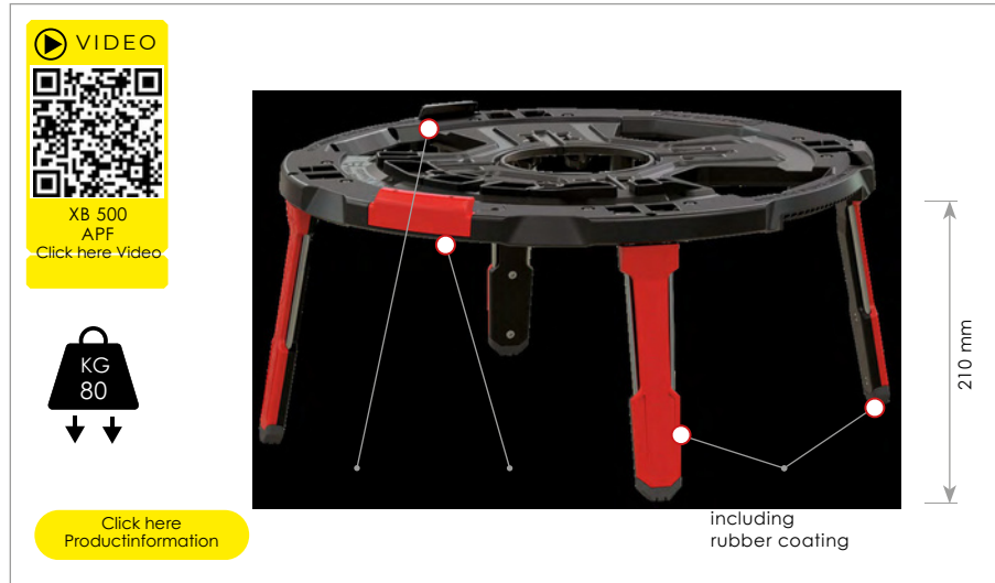
Adapter plate connected with XB 500 / XB 500 T